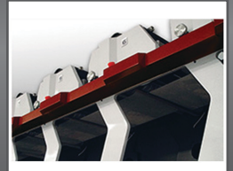
Performance Series P5 Printer for Pre-printed Labels

For more information call SATO Customer Service at 1-888-871-8741 or visit our website at www.satoamerica.com