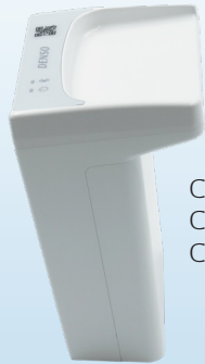
CH-SC1W Charging Cradle