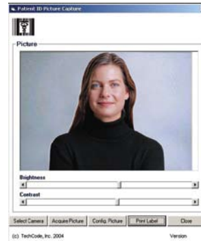
Photo feature lets you add a photo of the patient to the database.

Automates extraction and processing of the existing data stream from your ADT HIS system to populate the fields of wristbands and labels.