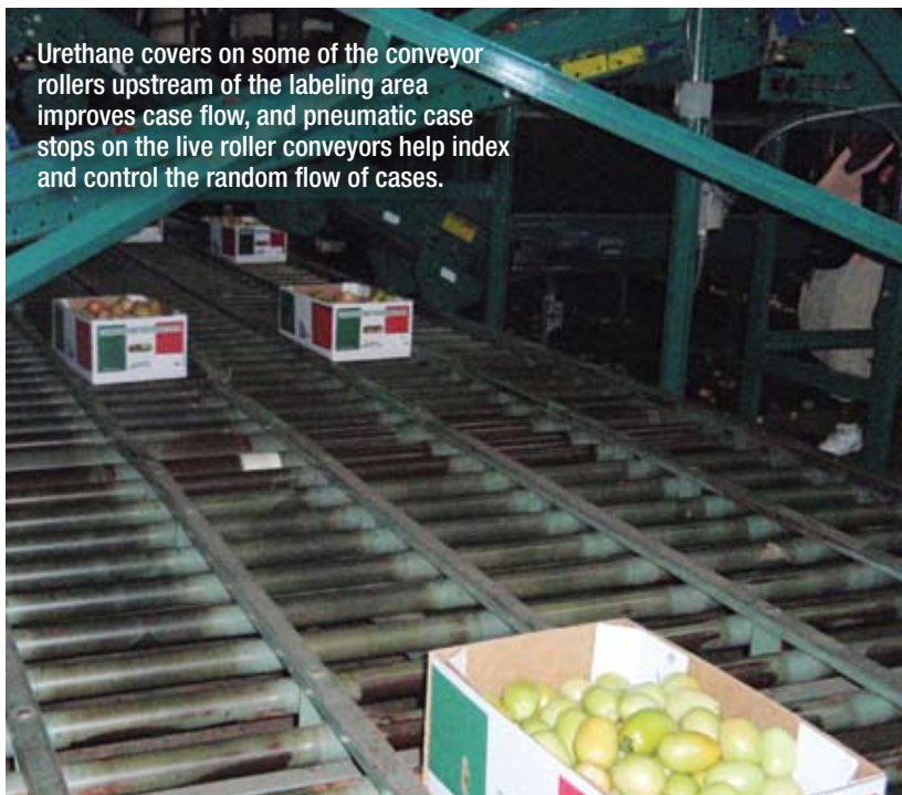
Urethane covers on some of the conveyor rollers upstream of the labeling area improves case flow, and pneumatic case stops on the live roller conveyors help index and control the random flow of cases.