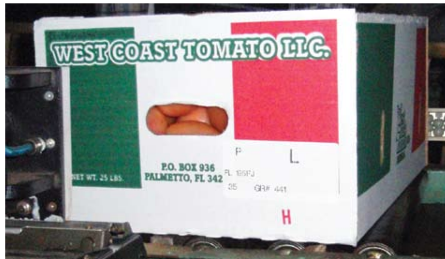
Two different automated fillers, each handling a different type of tomato, feed 25-lb cases of fruit to each line. As those cases merge, photoelectric eyes trigger the print/apply system to produce the correct label, depending on which filler the case came from, and apply it as the case moves down the conveyor.